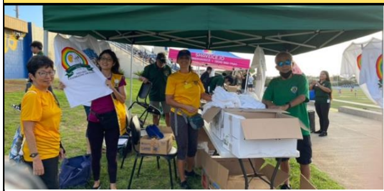
Hawaii Kai Lions assisting at UH Band Invitational.