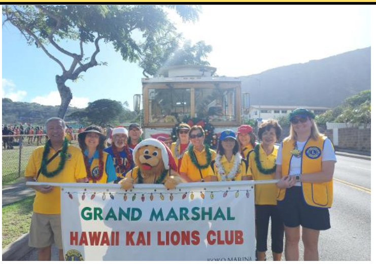
The Hawaii Kai Lions Club served as the 2023 parade marshal.