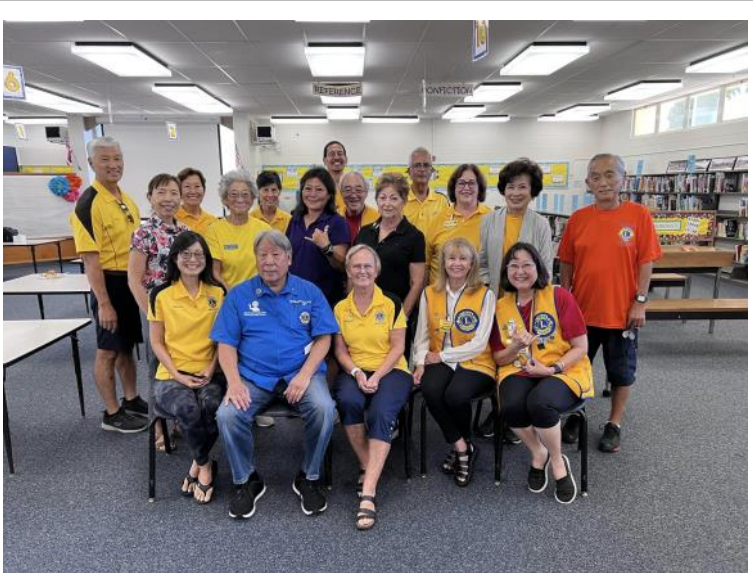
Hawaii Kai Lions provided hearing screening at Kaimloiki Elem.