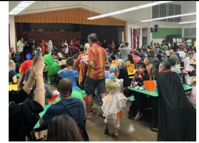
Packed cafeteria filled with students and parents at Boo Bash.