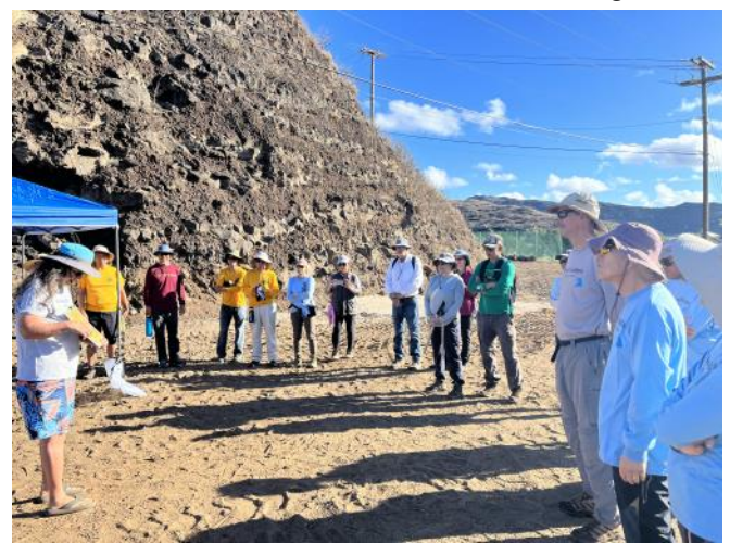
Hawaii Kai Lions with other volunteers at Ka Iwi trail clearing.