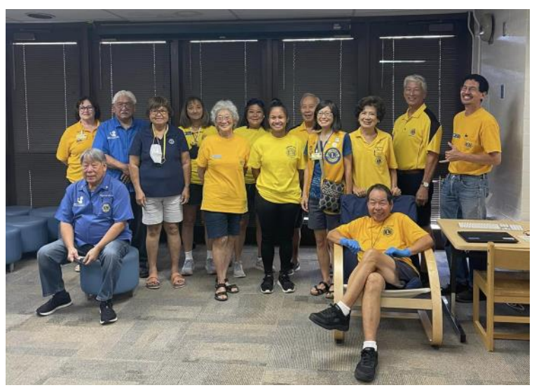
Hawaii Kai Lions assisted with Kahala Elem. hearing screening.